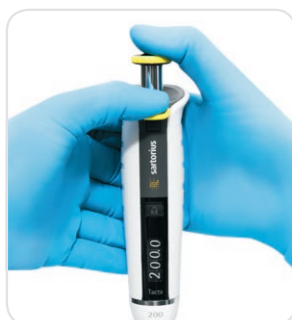
Built-in filter ejector in Tacta®