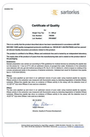
Lot-specific purity certificate

Our quality management system follows not only ISO 9001 and ISO 14001, but also ISO 13485. Tip production also abides by the ISO 14644-1 standard, in order to fulfil ISO Class 8 cleanroom conditions for secured tip purity.