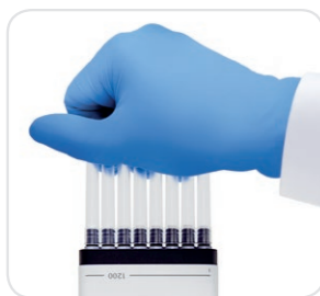
Optiload for a tight fit and equal sealing on every channel's tip cone.

Sartorius pipette tips meet the highest quality and purity standards. Sartorius tips are designed and manufactured to fit Sartorius pipettes perfectly, enabling maximum tip sealing and accuracy. This combination guarantees the highest performance and precision for your pipetting needs. Moreover, correctly fitting tips protect the pipette's tip cone from wear and tear.