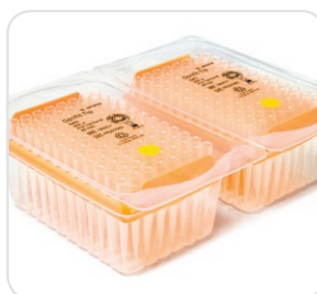
Single refill packs