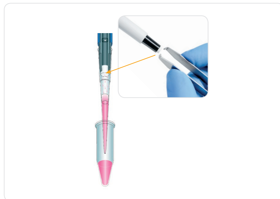
Tweezers for exchanging filters in pipettes are supplied with all pipettes excluding Tacta® and mLINE®.

To ensure that the user is protected from contamination, tweezers should be used when removing used filters from the pipette tip cone. The Tacta® and the mLINE® feature a built-in filter ejectors, so tweezers are unnecessary. In addition, the tip cone should be cleaned with ethanol (70%) prior to the insertion of a new filter.