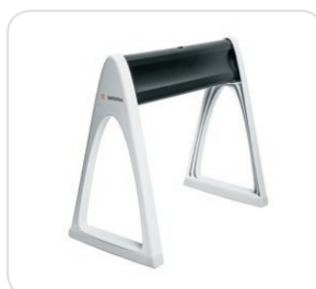
Linear Stand (non-charging)

* Supplied with a universal charger (EU, UK, US | JPN, AUS, KOR and CHN plugs)