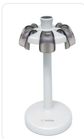
Carousel Stand (non-charging)

The simplest of all are the pipette holders which are attached to the front edge of a shelf. These are suitable for mechanical pipettes.