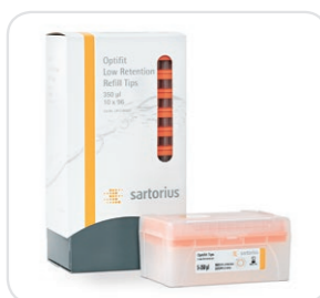
Packaging options for Low Retention tips