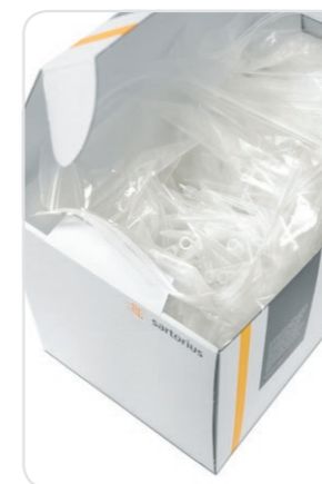
Bulk in a bag