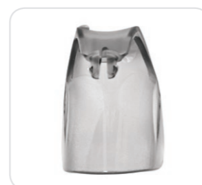
Adapter for Mechanical Carousel Stand