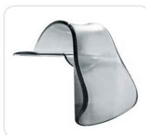
Pipette Holder for one pipette