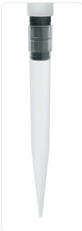
Optifit tips provide excellent tip sealing