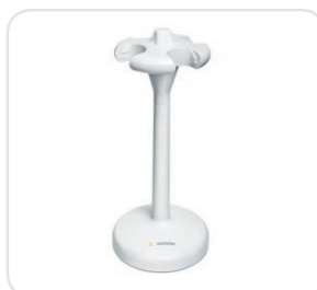
Charging Carousel Stand

When the pipette is not in use, it should be stored in an upright position in order to avoid contamination from work surfaces. Sartorius provides stands for all of its pipettes. It is recommended that electronic pipettes be stored and charged on a charging stand whenever they are not in use. In this way, their batteries always remain charged for when work begins.