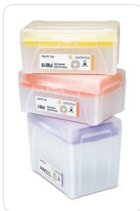
Single Tray Racks