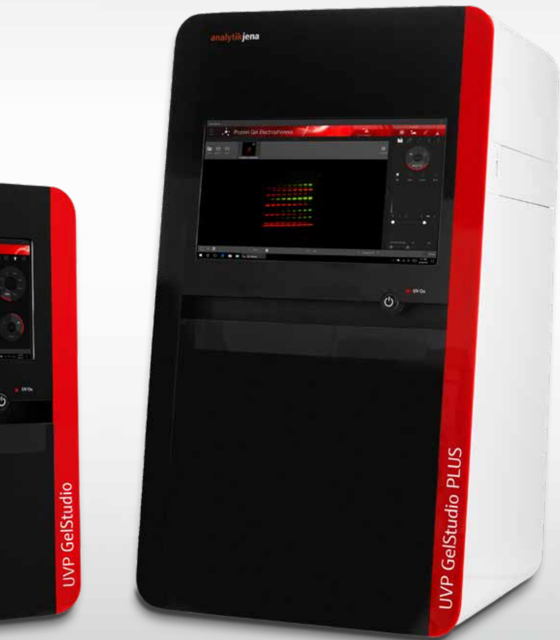
UVP GelStudio PLUS